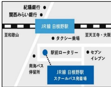
JR Hineno Station 9:02